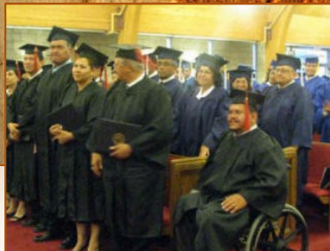
Hispanic Bible School Converge Worldwide Chicago, IL seminary for Spanish speakers